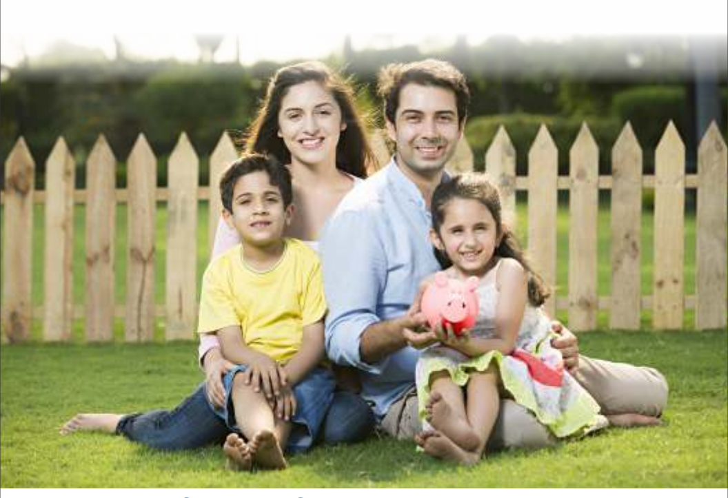
My family's future is guaranteed...

A Non-Linked Non-Participating Life Insurance plan