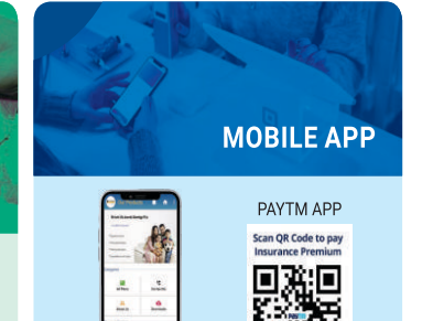
**Card swipe is available only at selected Shriram Life Branches